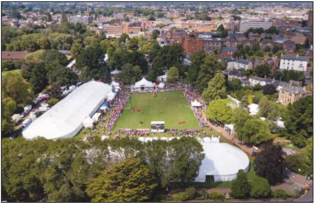
Aerial views of our 2017 show