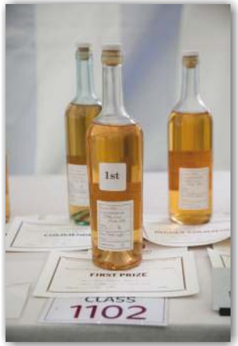
Dry white wine, class 1102

Rosé Wine . Not necessarily made from rose petals, this wine should be pink to pale red, delicate in bouquet and flavour, light in texture and alcohol and medium dry. It is suitable for serving at the table with many dishes.