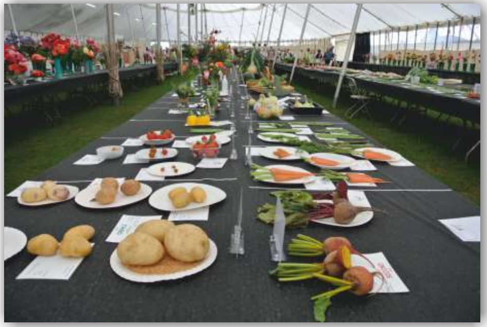
Horticultural exhibits at 2013 show

THE F. W. PENNY MEMORIAL TROPHY will be awarded for the best exhibit in classes 224 to 265 (cut flowers). 2013 winner: Catherine Popham.