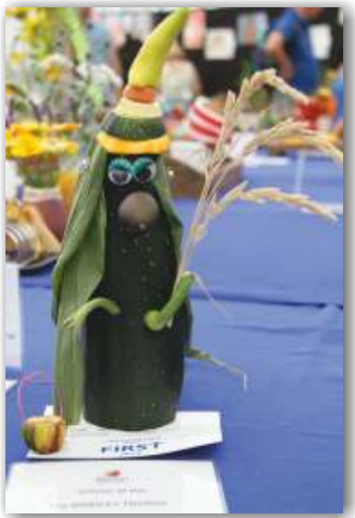
A figure made from fruit and veg - 2013.

Please make sure your entries are the correct size as stated in the descriptions below.