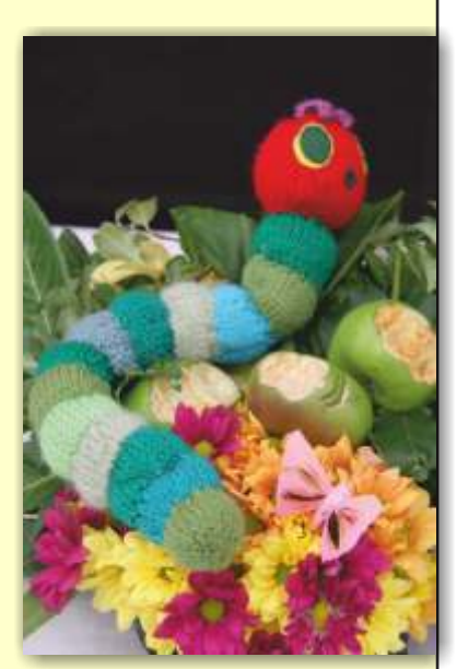
Fun with flowers, 2013

1007 "CHEMICAL REACTION". Space allowed: width 75cm, depth 60cm, height unlimited. Please see above for how to enter this class. 17 years and under.