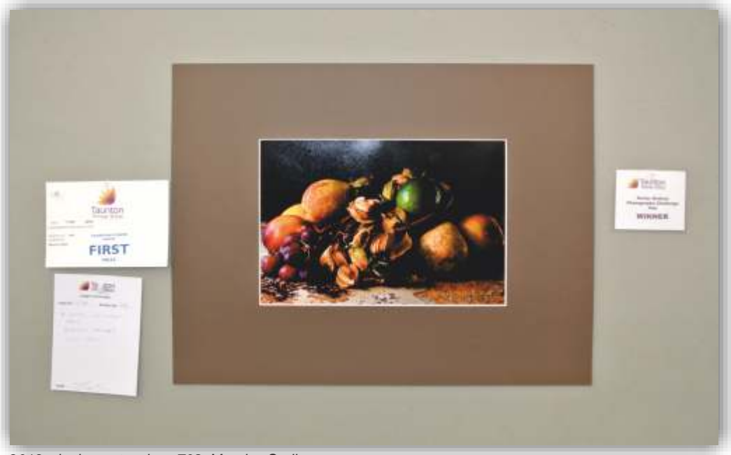
2013 winning entry class 708, Maurice Sadler

The photograph, printed on photographic paper, must be displayed within a mount and backed with card. External dimensions of the mount must be 50cm x 40cm. Internal dimensions should suit the photograph which can be of any size within the mount. A maximum of 24 prints will be displayed in the marquee. If more than 24 entries are received, the judge will select the best 24 photographs to be exhibited.