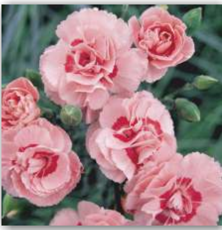
Pinks, classes 235 and 236