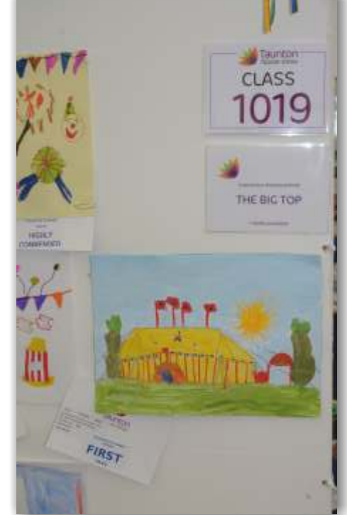
Painting of a big top, 2013