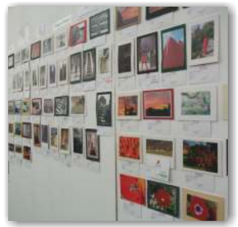
Photography, classes 701 to 707 at 2013 show.

Pairs: Two photographs to be exhibited together as a panel and displayed on a single A4 mount. The two photographs together must not exceed the size of the A4 mount.