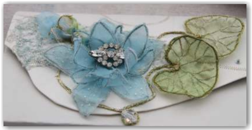
Textile Art jewellery, class 617