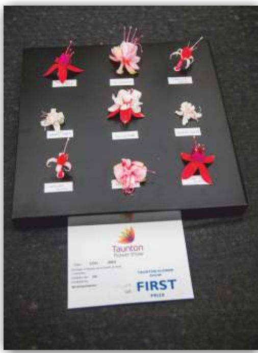
Fuchsia blooms on a board, class 254